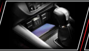
Open Tray with Illumination