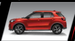
Pearl Delima Red**