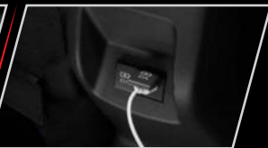
Rear USB Ports*