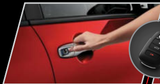
Electrostatic Switch Door Handle

Greater visibility of the front, side and rear.