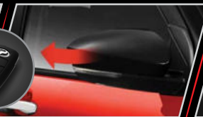
Auto Fold Side Mirror*