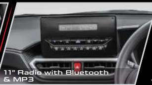
11" Radio with Bluetooth & MP3