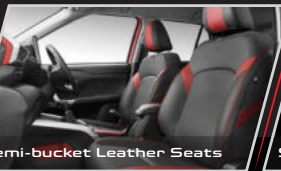
Semi-bucket Leather Seats