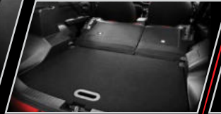
Full-flat Mode Rear Seats