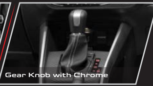
Gear Knob with Chrome