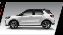
Pearl Diamond White*