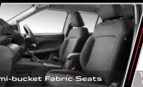
Semi-bucket Fabric Seats