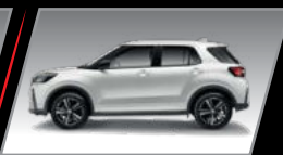
Pearl Diamond White**