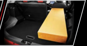
60:40 Split-folding Rear Seats