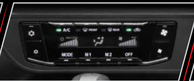
Digital Air Conditioner Controller with Quick OFF Button