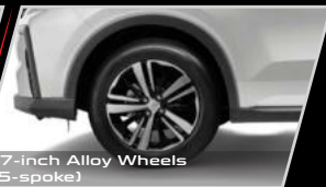
17-inch Alloy Wheels (5-spoke)