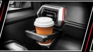
Built-in Cup Holder