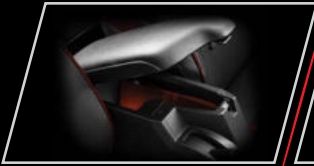
Console Box with Padded Armrest*