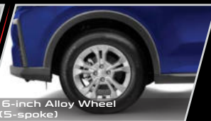
16-inch Alloy Wheel (5-spoke)