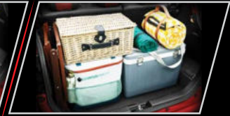
Tier 2: 369 litres