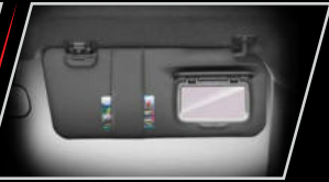
Vanity Mirror with Card Slot