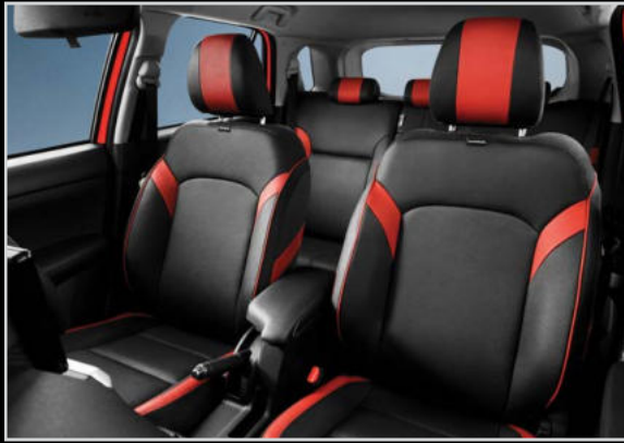
Spacious Interior for a Comfortable Ride