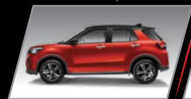
Pearl Delima Red*