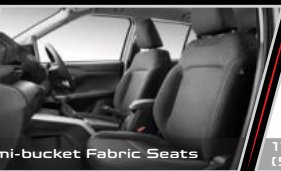
Semi-bucket Fabric Seats