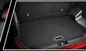
Tier 1: 303 litres