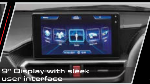
9" Display with sleek user interface